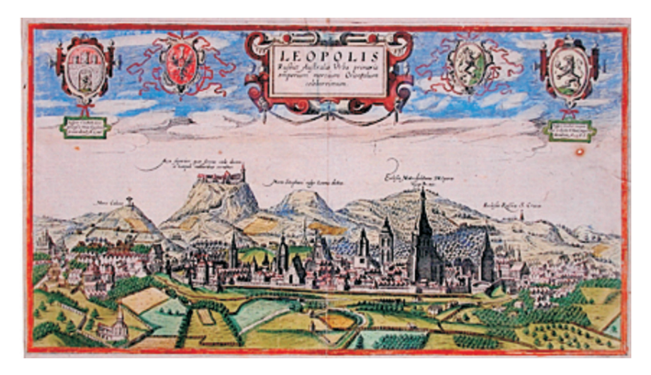
Fig. 2. View of Lviv it the city atlas CIVITATES ORBIS TERRARUM, 1617 (publishers Georg Braun and Franz Hogenberg, draftsman Aurelio Passarotti)

Of course, the vertical structure of Lviv can be not only visualized, but also metrized. It would be best,