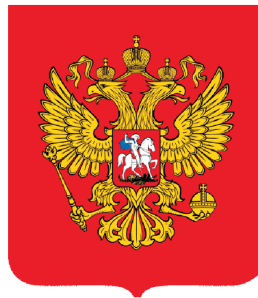
Fig. 2. The modern Russian national coat of arms

the State Emblem and the National Flag. The white-blue-red flag and the coat of arms, the golden double-headed eagle on the red field, were restored on 30 November 1993 by President B. Yeltsin Decrees, however, only on December 4, 2000, President V.V. Putin introduced a draft federal constitutional law „On the State Emblem of the Russian Federation” to the State Duma (Федеральный конституционный закон, 2000a). In the current version, adopted by the State Duma on December 8, 2000 and approved by the Federation Council on December 20, 2000, the emblem depicts a two-headed eagle with crowns, scepter and power; on the chest of the eagle in a red shield there is a rider on horseback, striking a black dragon with the spear (fig. 2).