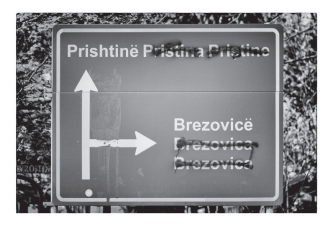
Fig. 4. Road signs in Kosovo

municipality's employees are required to speak Serbian as well as Albanian and they should accept Serbian document, but they do not do it and many road signs in this area have been vandalised, as the picture below shows (fig. 4).