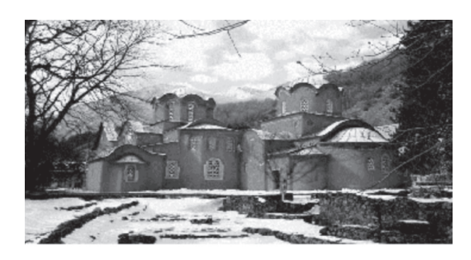
Fig. 2. Peć's Patriarchate

In order to better understand the role of Kosovo, and particularly Peć's Patriarchate (fig. 2), it is essential to point out that it represents the heart and the