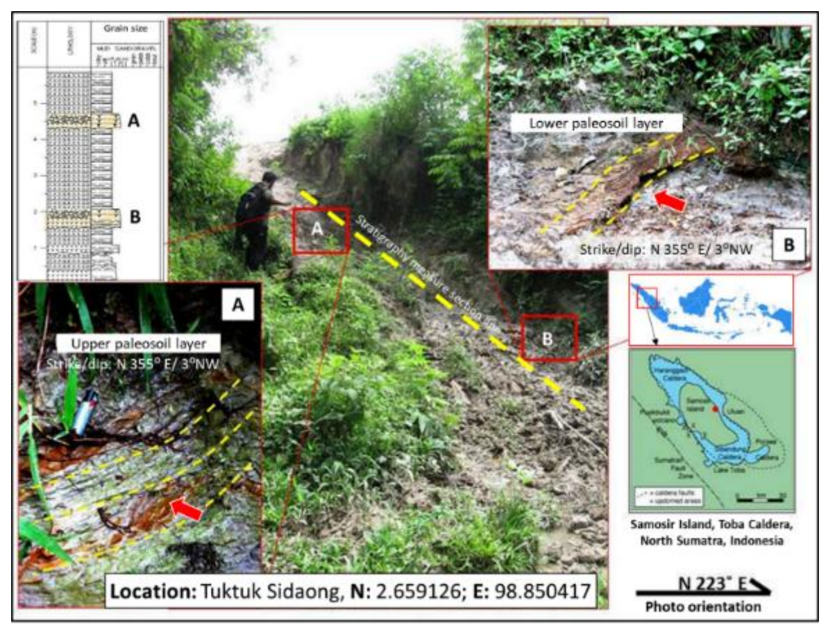
Fig 1. Observed paleosoil outcrop location & the section line that measured in this study.

polish it gently and avoid from the other rock sample soluble minerals. (5) illuviation of insoluble contaminations. Make sure the rock samples are dry mineral/compound, (6) in situ mineral alteration. The enough while it proceeds. After it polished, epoxy also result of images of the result shown in Figure 2 and dropped upon the surface of rock samples to make Figure 3. more clearance visualization under a stereomicroscope. Besides its observer in normal light, we pedoturbation in rock samples in 20x magnification. also take an image of the samples in the negative Paleo-pedoturbation defines as the mark of the past image to reconfirm a paleosoil feature pedoturbation more contrast as well.