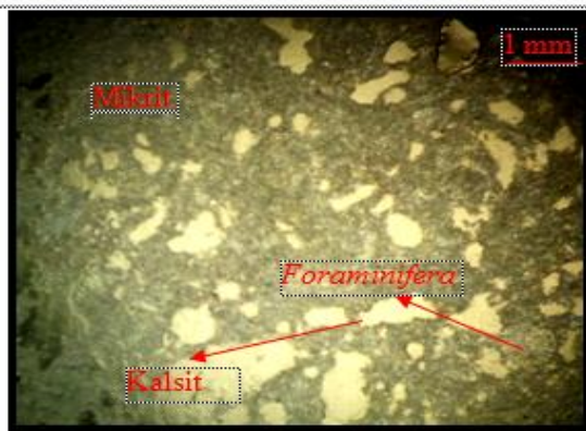
Fig. 1. Micritisasi microbial on Foraminifera Fossil in Limestone (Petrographic Analysis cross nicol with magnifications 10x)

serves to protect the fossil shells so that it is more resistant to the dissolution. (Figure 1)