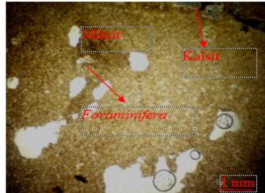
Fig. 3. Micritisasi microbial on Foraminifera Fossil in Limestone (Petrographic Analysis cross nicol with magnifications 10x)

grain drilling activity by endolithic algae, fungi and bacteria around skeletal.