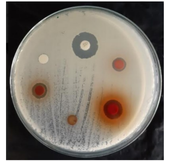
Figure 2. Screening of the active fraction; (a) ethanol extract, (b) n -hexane fraction, (c) ethyl acetate fraction, (d) methanol fraction, (e) positive control (Vancomycin 30 \mu g) and (f) negative control.

In the results of this study, the antibacterial activity of the extract and fractions were observed due to their phenolic content. The difference in the total phenolic of each sample affected the resulting zone of inhibition. This was proved by the finding that the higher the total phenolic content, the higher the zone inhibition diameter of Staphylococcus aureus ATCC 25923. The phenolic compounds will inhibit the growth of Gram-positive bacteria because of their ability penetrate the bacterial to cell walls (Purwantiningsih et al., 2014). Phenolic compounds reduce the permeability of the bacterial cell wall by destroying cell membranes. activating enzymes, and denaturing cell membrane proteins. Changes in the permeability of the cytoplasmic membrane can cause the transport of important organic ions into the cell to be disturbed. This will inhibit growth and even cause cell death. Studies have shown that high concentrations of phenolic compounds will penetrate and disrupt bacterial cell walls (Purwantiningsih et al., 2014).