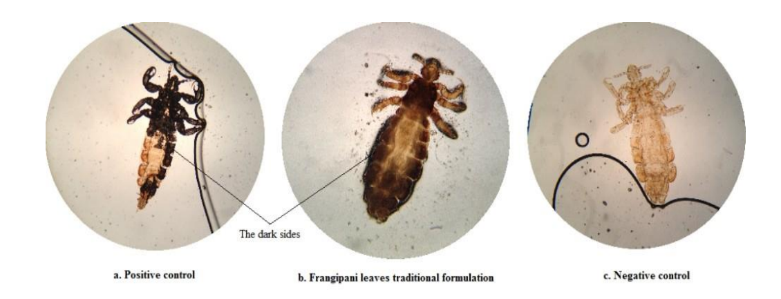
Figure 2. Histology after each treatment of the positive control group (permethrin 1%), frangipani leaves traditional formulation, and negative control (coconut oil) (the photo is personal documentation)

formulation; C4 = Sugar apple leaves traditional formulation; K (-) = Negative control (coconut oil).