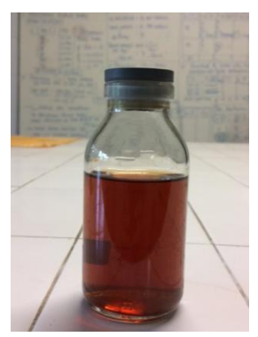
Figure 1. Tempeh extract nanoparticle preparation of lipid nanoparticles (a) and silver nanoparticles (b)