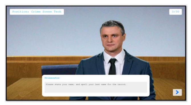
FIGURE 6 Prosecutor asks questions on direct examination.

After being seated, the prosecutor then begins his/her direct examination of the witness following the scripted questions. In response to each question, the students answer by simply typing their answer and hitting "Enter" (see FIGURE 6 ).