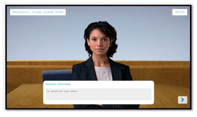
FIGURE 8 Testimony and exercise ends with no questions from the defense attorney.

At the completion of the exercise, the program automatically creates a transcript of the witness' testimony and places it in a folder for review, grading and critique by the instructor (see Figures 9 and 10 ).