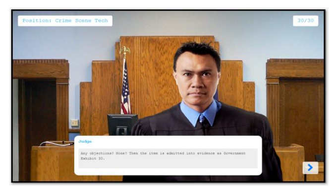
FIGURE 7 Judge admits the firearm into evidence.

The testimony continues to the point where the witness responds to the questions necessary to authenticate the firearm being offered in evidence. The firearm is offered as evidence and with no objections, the judge admits it into evidence as a government exhibit. In this scenario, the defense attorney has no questions for the witness on cross-examination and the witness is dismissed, thus ending the lay witness scenario (see FIGURES 7 & 8 ).