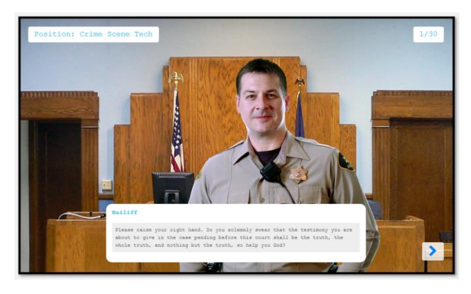
FIGURE 5a Bailiff swears-in witness to begin the testimony.

Using the lay witness scenario as an example, the scenario begins with the student entering the courtroom and being sworn-in by a bailiff (see FIGURES 5a and 5b ).