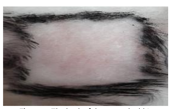
Figure 1. The back of the treated rabbit

Before testing the effectiveness of hair growth in rabbits, rabbits had to be adapted for seven days. The rabbits consisted of four rabbits: experimental animal on the back was divided into six boxes, three left and three right sections with an area of 2x2 cm<sup>2</sup> each with a considerable distance of 2 cm2, while three experimental animals were divided into two boxes, one left and one right with 2x2 each. The hair in each box was shaved until bald and then smeared with ethanol to prevent irritation.9