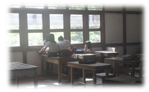
Fig. 3 The condition of classrooms

Further to the science lab space (IP-3) each SMP/MTs provided a space science laboratories, provided enough tables and chairs for 36 students, and include a set of equipment for the practice of science demonstrations and experiments learners. But there was still dioptimalkannya equipment available to the relevance also considering that administer teacher competence.