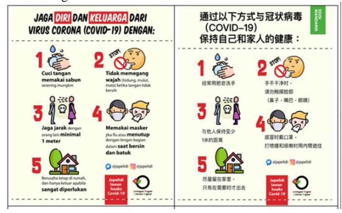
Fig. 4 Indonesian and Mandarin Version of Covid-19 Educational Poster from Japelidi

Digital Poster shown on figure 4 and figure 5 is covid-19 educational poster develop by japelidi (jaringan pegiat literasi digital). The purpose of the poster is to educate how to avoid exposure to corona virus. The originator of the poster also develop and publish the poster with 44 different local languange in Indonesia (Rahadi, 2020). This method was quite interesting hence more than 10 digital newspaper and government official website published this article (Doddy, 2020). Figure 5 shown sample of poster with Banjar and Minang version.