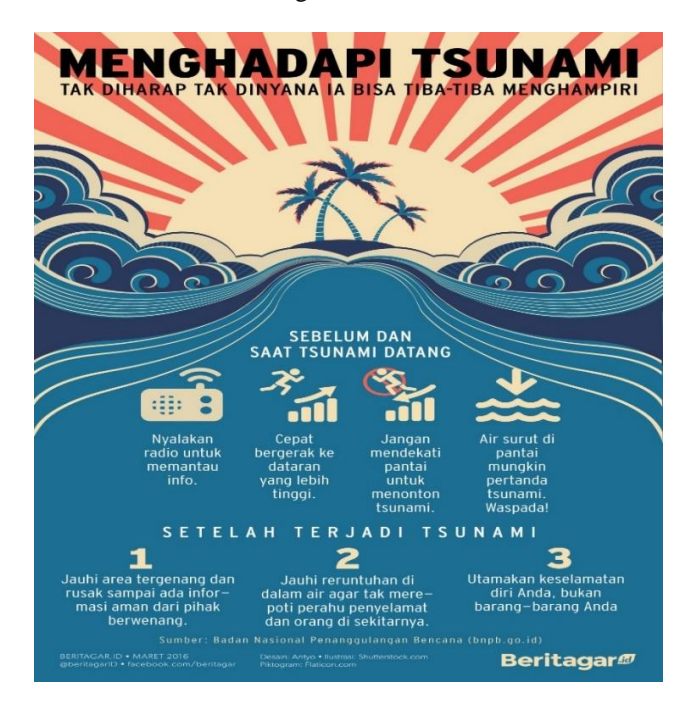
Fig. 2 Tsunami Educational Poster

Other example of similar digital poster with figure 1 with additional detail shown in figure 2.