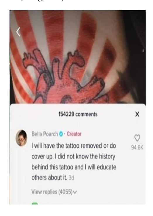
Fig. 3 Bella Poarch's Tatto and Her Comment's

Figure 3 shown controversial tattoo of Bella Poarch, female tiktok artists who has the most followers in the world with more than 57 million followers (Online, 2020). Figure 2 and figure 3 have similar component that is the sunrise characteristic of the country of Japan. In the illustration the sunrise can be meaningless in Indonesia and accepted by the Indonesian people. However, it is unacceptable in China and Korea because it symbolizes Japanese colonialism in China/Korea (Ching, 1997).