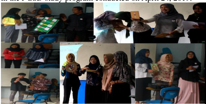
Fig.3 Product Presentation Seminar in cycle 1 development of learning media for constructive game tools for elementary school students

The DO phase or the lecture implementation stage in this lecture is carried out for elementary learning media courses in the PGSD study program conducted on April 24, 2019.