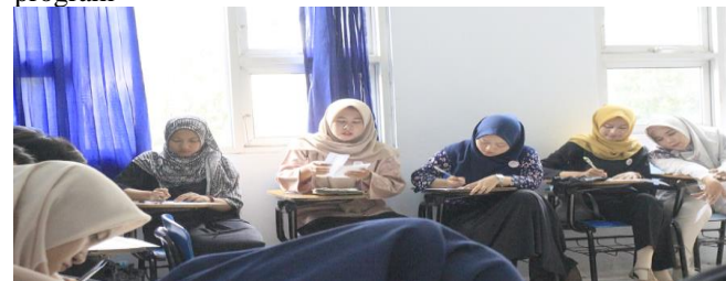
Fig.6 Filling out Questionnaire as a Reflection of Lecture Activities by Prospective Elementary School Teacher Students

The see or evaluation stage is done directly after the do phase is completed, namely in April 2019. At the see stage the lesson study implementation team discusses the results of all activities that have been carried out at the do stage. One of which was discussed was the results of the questionnaire which was the result of a response back from students in the implementation of lesson study in lectures on elementary learning media PGSD FKIP Unswagati Cirebon study program