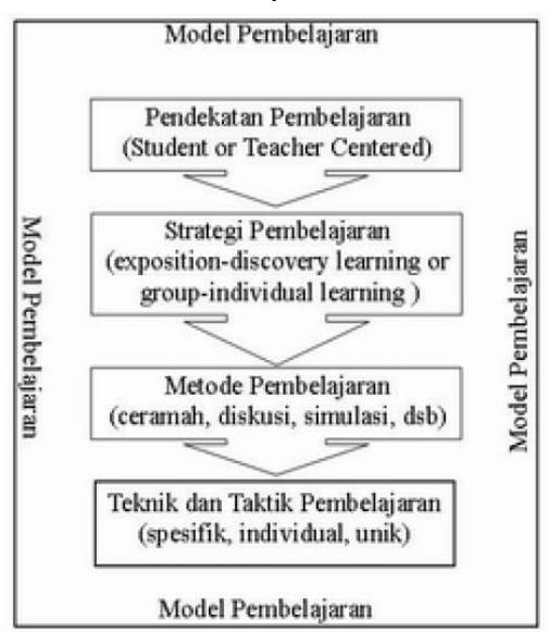
Figure 1. Components of the Learning Process

Before examining learning models, it is better to look at some of the terms commonly used in the education world. Terms such as models, methods, strategies, techniques and tactics are often used in learning activities. However, it is not uncommon for a researcher to seem less observant in distinguishing some of these terms. The use of these terms seems to have something in common with each other. Even though the term actually has a different essence. Joyce & Weil (2009), Sudrajat (2008), Komalasari (2010), and Rusman (2011) have similarities in studying learning models. Basically the learning model is a systematic learning plan which includes learning approaches, methods, techniques and tactics as follows: