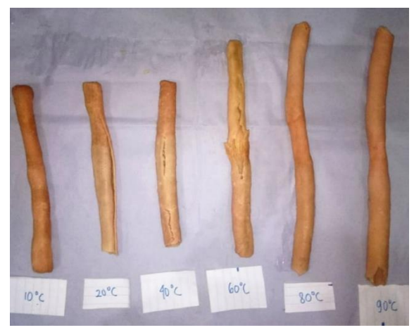
Figure 2. Edible straw product

The production of edible straws, of course, uses 100% food grade materials so that they do not cause side effects when eaten. Edible straw made from dragon fruit peel with the addition of gelatin and CMC has a hard texture. Based on the research, edible straws that have been tested for temperature resistance and water absorption tests have changed in texture to become mushy. The edible straw that has been analyzed is shown in Figure 2.