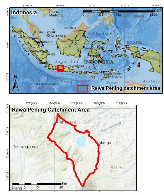
Figure 1. Study location in map

This study is more precisely located in the Rawa Pening Catchment Area, where the area is an upstream part of the Rawapening Watershed sub-watershed. Administratively, the Rawapening catchment area is in Semarang Regency, Central Java Province, Indonesia (Figure 1). Geomorphologically, Rawa Pening is surrounded by mountains that function as water catchments area (Sanjoto et al, 2020).