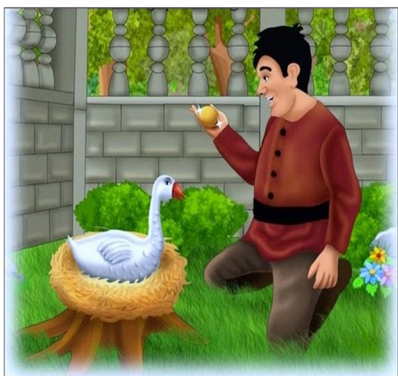
Figure 2 Fable story text entitled “ the goose that laid golden eggs ” Taken from popular fable story text ©www.kids-pages.com.

The English teacher ready with the reading text and this fable story text actually,