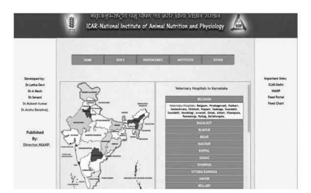
Figure 3. Healthcare information

based livestock advisory system developed is compatible with all browsers and devices: PCs, laptops, tablets, mobiles. The screenshots of the information system are given in Fig, 1, 2 & 3.