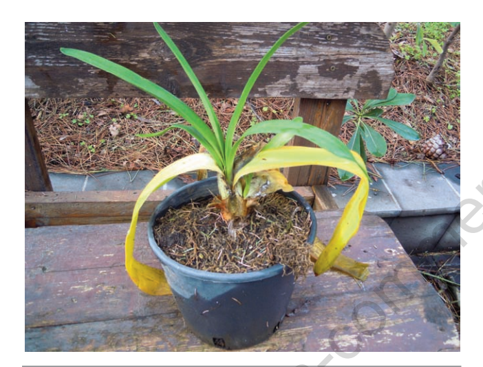
Figure 1. A potted African lily, Agapanthus sp.