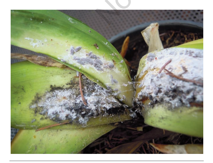
Figure 2. A colony of Vryburgia amarillidis on the basal leaves of potted Agapanthus sp.