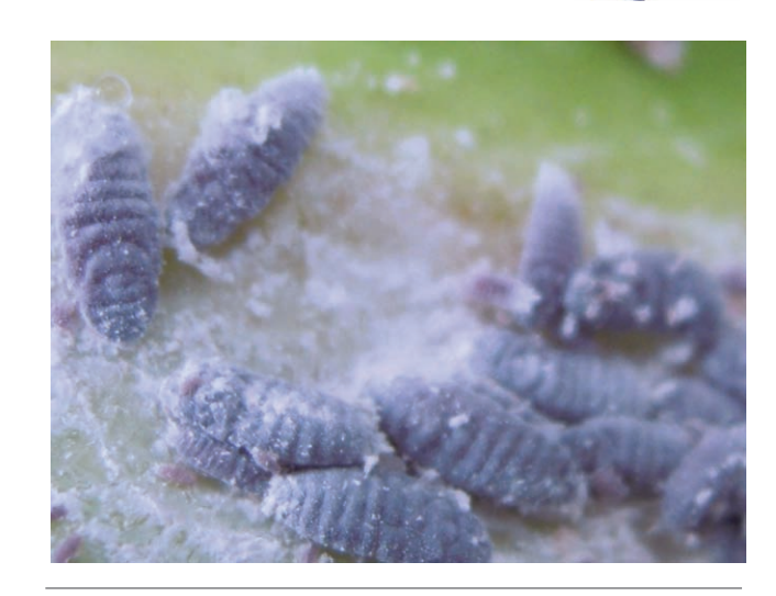
Figure 3. A colony of live female Vryburgia amarillidis.

The populations found in Sicily were morphologically closer to the populations from California (McKenzie, 1967) than to those from New Zealand (Cox, 1987). The Sicilian populations have more numerous trilocular pores than those from California and New Zealand. Other differences in the number and distribution of multilocular disc pores and ventral oral rim tubular ducts fall in the range of expected variability for this species.