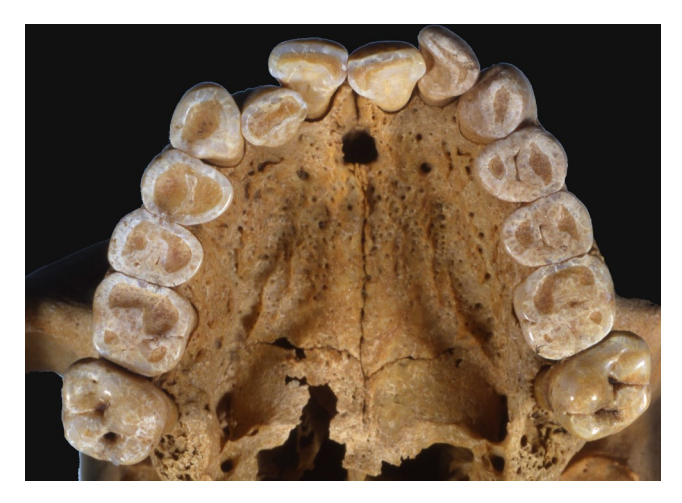
Figure 4. Maxillary teeth that illustrate crowding.