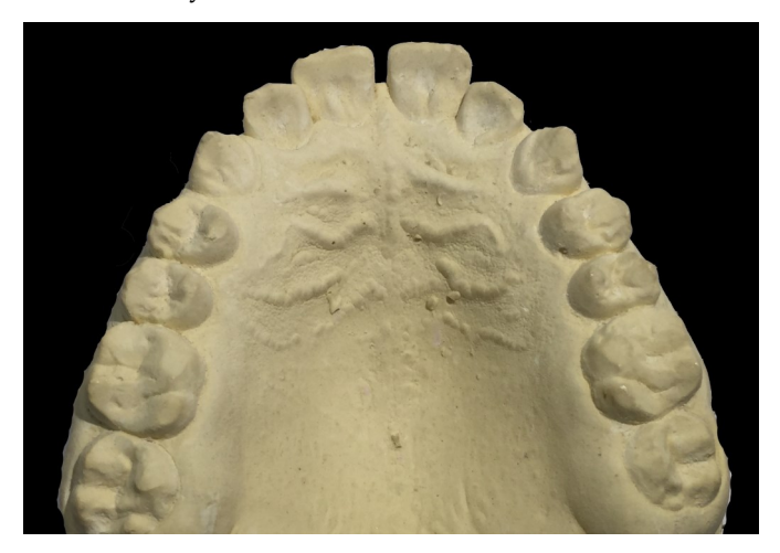
Figure 1. Individual with a midline maxillary diastema (score of 1), and a canine diastema (score of 1).

Affected teeth: maxillary central incisors, mandibular canine, maxillary canine