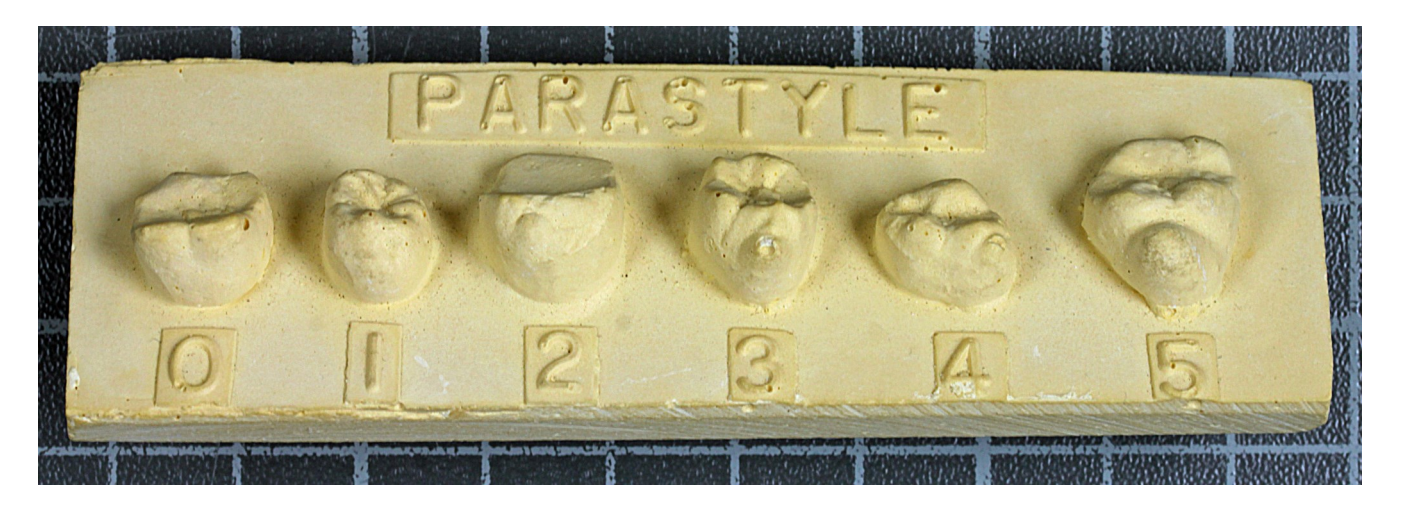
Figure 1. The dental plaque developed by Katich and Turner in 1974, used to standardize scoring of the parastyle and to delineate its degrees of expression.

The method used in the production of the dental casts was uniform for all the groups studied. Alginate impressions were obtained of the subjects' dentitions