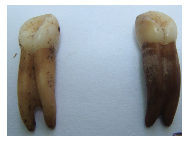
Figure 2. Deciduous lower two-rooted canines. Lingual view.

nals for diagnostic and endodontic therapeutic purposes. In such a way, according to the configuration of the pulp chamber of the tooth and root canals, the case reported is classified as a type I, where each root has a single canal that ends in its own apical foramen. Also, according to Turner et al. (1991) the case was classified as a mandibular two-rooted canine. Turner et al. (1991) standardized the observation of the number of roots of the mandibular canines, in which there are one or two roots, where the second one –usually a small, conical-shaped root directed towards lingual surface—is separated from the root trunk at the middle third.