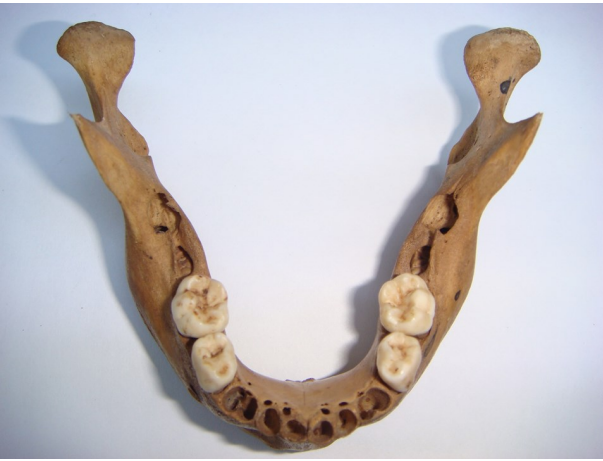
Figure 3. In alveolar process of the deciduous lower two-roots canines of the mandible is evident the interradicular septum.

A systematic review of the literature in PubMed (a