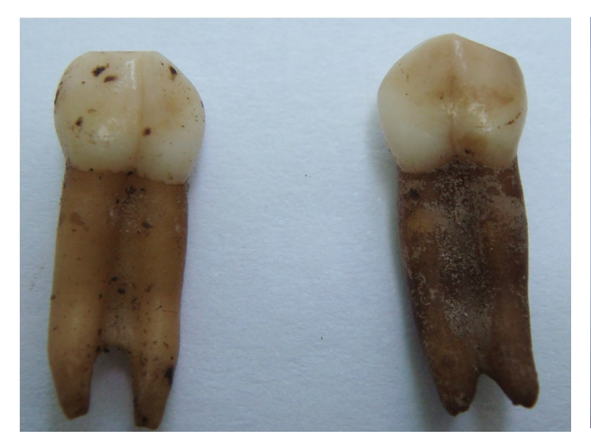
Figure 1. Deciduous lower two-rooted canines. Buccal view.