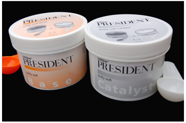
Figure 1. Molding compound

time frame (Figure 2). The molds were then equally divided into groups of 196 and placed in three separate environments: room temperature, hot/humid and cold/dry. After removal from the test environments Epotek 301 (Epoxy Technologies, 2019) was poured into each mold to form a cast of the individual tooth. Epoxy was chosen over a dental stone casting material like gypsum due to its durability and common use in the field (Egocheaga, 2004;