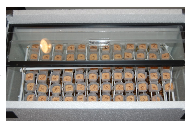
Figure 4. Hot humid environment

temperature and relative humidity of the study environment every 6 hours to ensure that conditions were maintained.