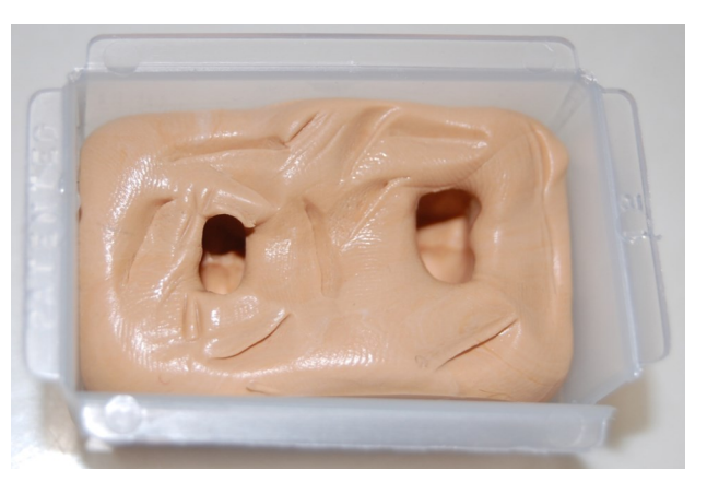
Figure 2. Dental mold

Mihlbachle, Foy, & Beatty, 2018; Stynder et al. 2018; Ungar Livengood, & Crittenden, 2019; Ungar & M'Kiera, 2013; Ungar & Williamson, 2000).