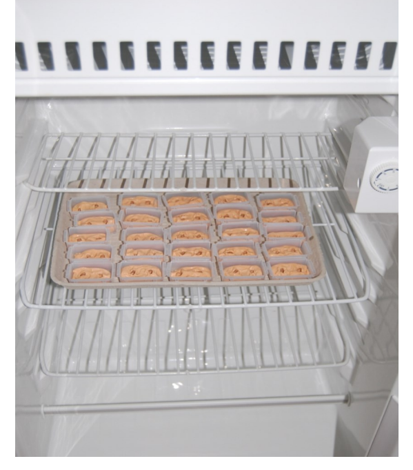
Figure 3. Cold dry environment

field conditions in places like the highlands of Peru, the Alps, and Siberia, so a set of 196 molds was placed in a refrigerator with a drying agent, a 10oz container of calcium chlorite moisture absorber, mimicking the effects of a cold and dry environment; the average temperature was 32°F with a variance with a RH of approximately 33% (Figure 3). The final set of 196 molds was placed in an insulated aquarium with a heat source, a reptile under tank heater, set to 95°F and kept the bottom of the tank covered with water between a <sup>1</sup>/<sub>4</sub> of an inch to 1 inch of water to attain an average temperature of 95°F and an approximate RH of 99% (Figure 4). This hot and humid test environment was designed to replicate field conditions found in Central America, Southeast Asia, and parts of Oceania. Air temperature and relative humidity were monitored in each environment by placing HOBO automatic data logger sensors placed directly beside the molds throughout the entirety of the study. Each of the three sensors was set to record the air