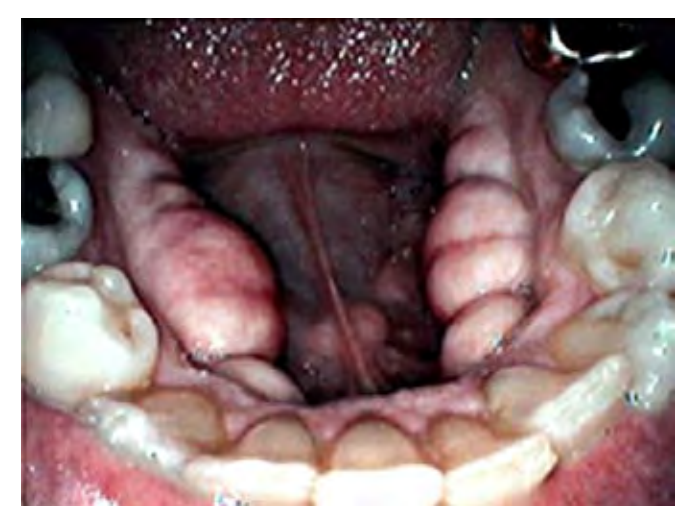
Fig. 3 . Example of torus mandibularis in a living individual.