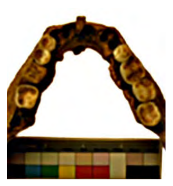
Fig. 2 . Example of moderate expression of torus mandibularis in a skull (SK112) from Cannington Cemetery.

Attrition was scored at the left first and second molars, both upper and lower, and the "edentulous" category represents individuals who had premortem loss of the teeth. Remodeling activity at the temporomandibular joint (TMJ) was assessed on morphological changes to the joint surface both on the mandibular and the temporal