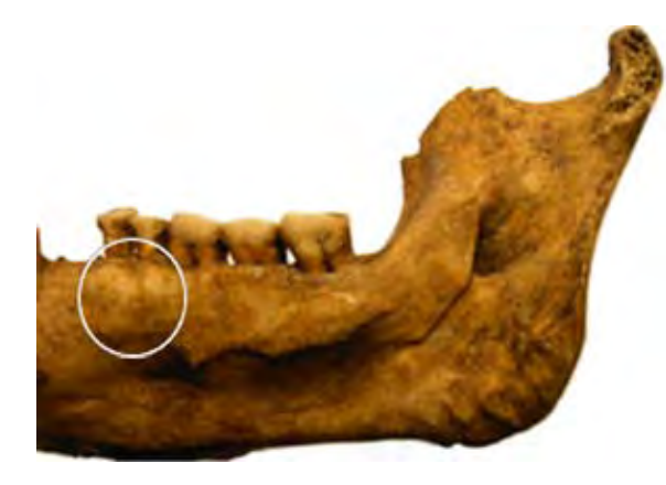
Fig. 1 . Example of slight expression of torus mandibularis in a skull (SK34) from Cannington Cemetery.

functional stresses placed on the masticatory complex, the age estimates garnered from scoring tooth wear were excluded. Sutural closing of the cranium was used instead, though this method is rightfully criticized for its unreliability (Masset, 1976). Therefore, the age categories used here are very broad-young adult (17-34 years of age), adult (35-54 yr), and older adult (55+). This study counts trait presence in three categories, namely absent, unilateral, and bilateral. Metric equivalents of these categories (measured as maximum tori breadth on the transverse plane) are delineated in 2 mm increments with less than 2 mm being "slight," 2-4 mm "moderate," and greater than 4 mm "pronounced." Examples of the slight and moderate categories are provided in Figures 1 and 2. An example of the trait as it appears in a living individual can be found in Figure 3.