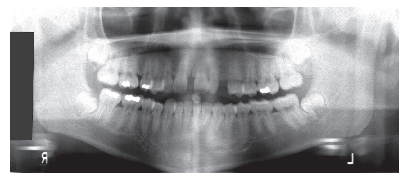
Fig. 1 . Panoramic radiograph of case KP. All of the permanent teeth, including the 4 third molars, are mineralizing. Congenital absence is limited to the left and right maxillary canines.

incisors and, perhaps, lead to incisor crowding at this stage. It seems that, without the canines, incisors in the anterior segment remain spaced.