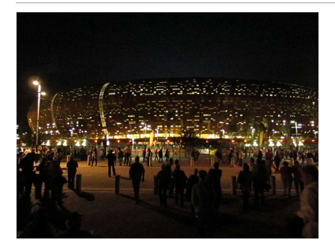
Figure 3: Soccer City, Soweto on the night of Diamond's performance – it left me with the impression of a huge spaceship.

During the performance in Soweto that I attended I noticed adults of varying ages almost ecstatically participating in the performance. Diamond heads , as his fans are known (Bream, 2009:14), were waving their arms from side to side and, with beaming smiles on their faces, they were throwing back their heads and singing at the tops of their voices as he repeatedly sang "I'm a believer" and "Sweet Caroline". I saw adult men being moved to tears. Audience reactions of this kind are naturally not exclusive to Diamond's fans. Similar reactions and enthusiastic participation are indeed also found with other performers. Yet very few of the latter have been performing since 1966. Diamond was an outstanding performing artist.