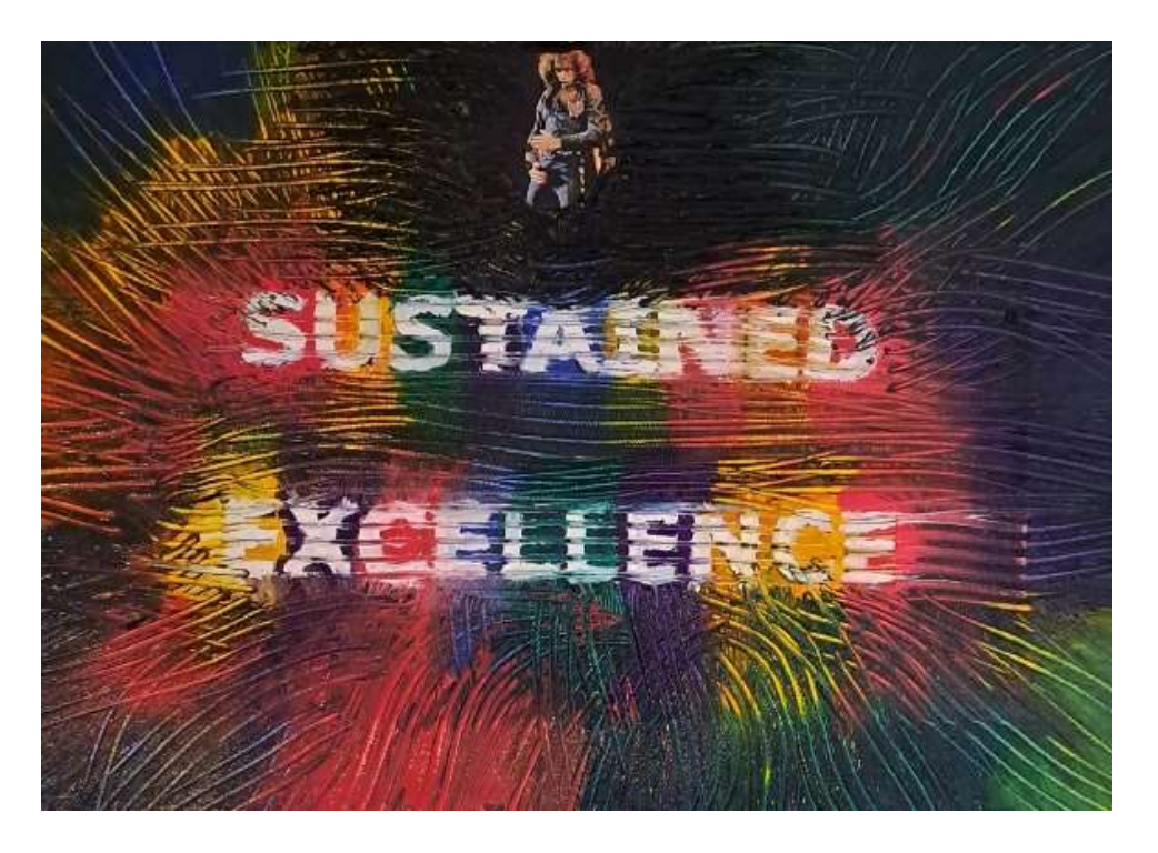
Figure 9. The author's painting representing Diamond's positive core, and the provocative statement of this study.

As the final creative act of my process of transformative learning I created a painting – if one could call it that (see Figure 9). I used my colorful oil paints to create a picture with, on top, a picture of a youthful Diamond during his Hot August Night concert in 1972 – one of the most famous pictures of the legendary singer. I framed it with thick, black paint – the color of his favorite outfits. In the middle of the painting, the words "Sustained Excellence" remind me of what I regard as the secret of Diamond's long career.