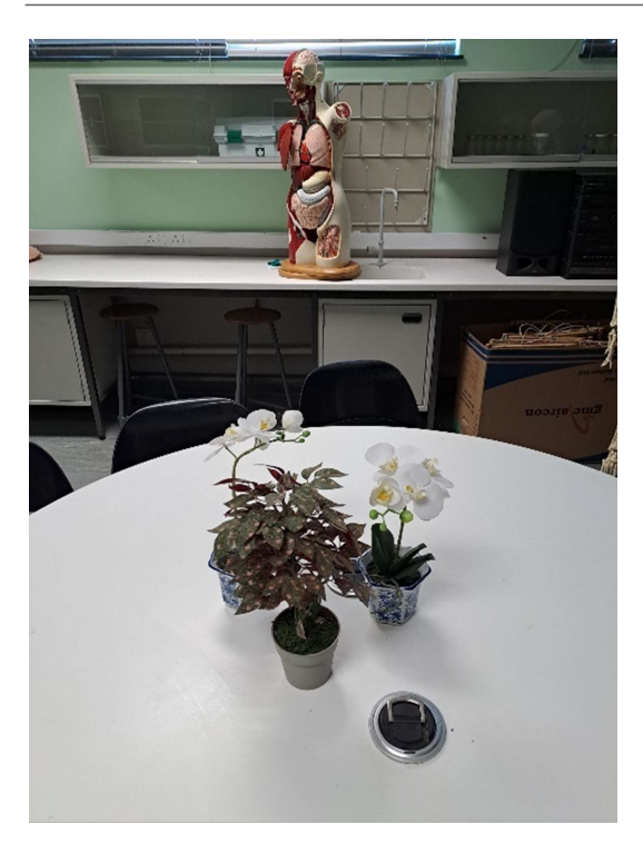
Figure 8. The artificial orchids and potted plant in the author's lecture hall. Like him, I look at these to humble myself and to remind me about what I have learned from him and his concert.