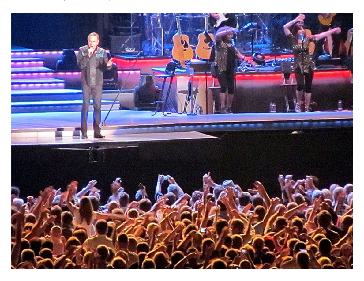
Figure 4: Diamond's concert in Soccer City, Soweto: attended by an enthusiastic, almost worshipping audience.

The photo taken during his Soweto concert (see Figure 4) clearly illustrates enthusiastic audience participation. Four of the questions included in the structured questionnaire were utilized to explore the members of the study group's experience of Diamond's interaction with his audience (see Table 1):