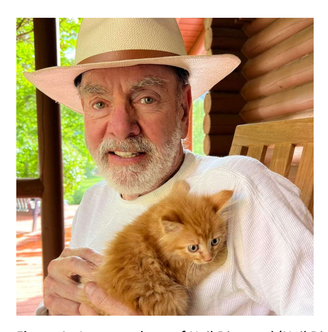
Figure 1: A recent photo of Neil Diamond (Neil Diamond, n.d.)