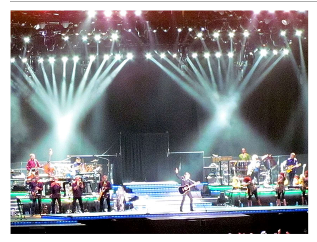
Figure 6: The lighting.