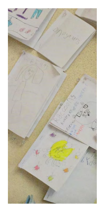
Figure 4. Photograph of child-made books displayed on the wall in the communication centre.