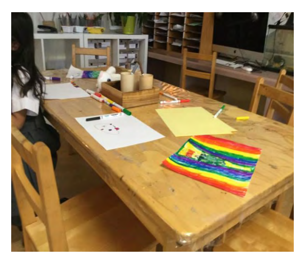
Figure 2. Mandy's photograph of the communication centre.

Mandy: It's communication, where we draw stuff and make stuff. Different things. We talk to each other and we make different things.