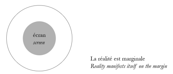
Figure 3: The screen and the reality in the scenic operative device (Lacan, Séminaire XI , 91)

The real spills over the margin; on the periphery of masks, the subject as well as the object of the scopic exchange manifest, point out, a reality that escapes the lure, an external dimension of desire that is irreducible to the tricks of stage-play. Lacan figures this peripheral dimension of reality in the pictorial device as follows: