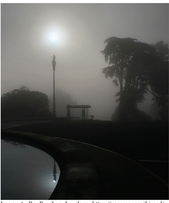
Image 1:

We take our start from the story's narrator who, we learn, has been asked to