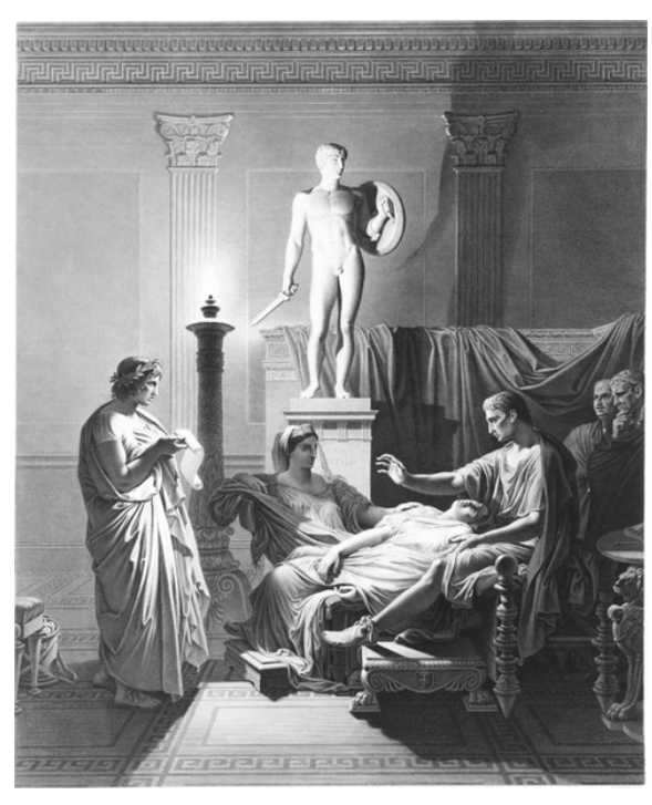
Image 2: By Charles-Simon Pradier - Public Domain, https://commons.wikimedia.org/w/index.php?curid=31178176

erally blocked by Augustus's upraised hand that interrupts Virgil's recitation of his text (see Image 2). Out of the swoon that replaces or perhaps now becomes the act of "reading," an alternate, 'cinematic' history of representation unfolds, which is set forth in the Museum's ensuing exhibits A "Chinese vase," like the omphalous of some other reproductive process, "probably brought back by a naval officer,"15 highlights ideographic and phonosemantic rather than alphabetic writing systems, shrugging off what Saussure calls the "linear nature of the signifier" in favour of a more visual simultaneity.16 In the "group of porous fossils" that follow it, we encounter moulded images cast directly through the Earth's own, material, printing techniques - inscriptions by a representational 'agent' that is utterly removed from human hands and human time. "A pale worm in clouded alcohol" is similarly suggestive, not