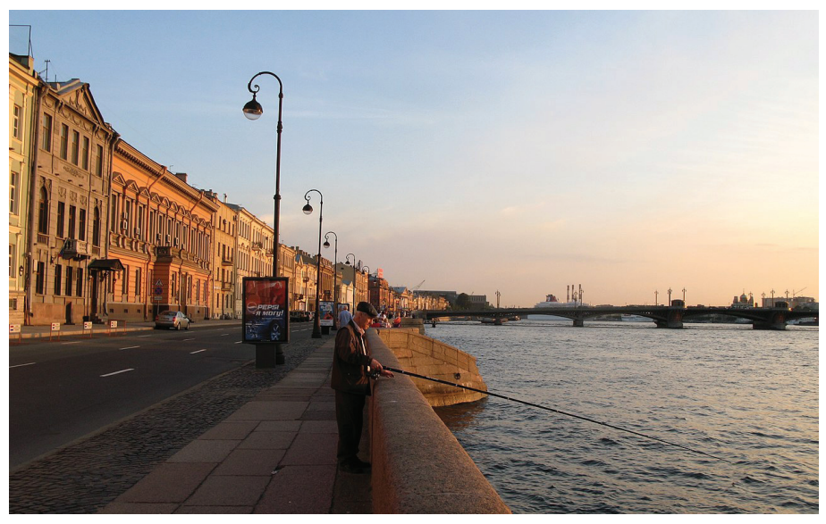
Image 5: Английская набережная [English Embankment], St Petersburg, 12 June 2009

spinning along on a silver-shining bicycle," scarcely noticed until now throughout the tale: the October night, the Owls, the Oriental vase, Orpheus of course, the Obvodny canal, the narrator's exclamation "Oh!" and, finally, the truncated sign: "OE REPAIR." If the soles of language's metrical 'feet,' the connecting legs of the Symbolic's transport system, can be patched, Nabokov suggests, it will be by way of another operation of seeing and hearing secreted within History's rectilinear perceptual order. Nabokov's cinematic parallax forces it into the open.