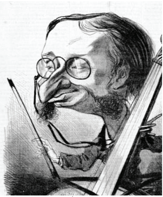
Image 4: By Nadar after Édouard Riou - Bibliothèque nationale de France, Public Domain, https://commons.wikimedia.org/w/index.php?curid=11543458

Photography's "likeness," a mimetic concept tied to the idea of a pre-existing real, finds itself over-written with quivering, proto-animated lines drawn perhaps by the "ghost" hand secreted in the custodian's pocket as some sort of manual dex-