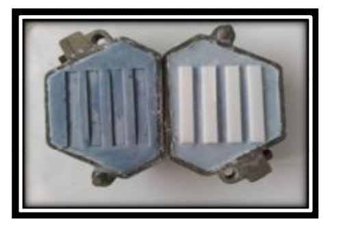
Figure 2: Mold preparation for transverse test specimens

After complete setting of the stone the flask opened carefully to separate the two halves as shown in figure (2) and the plastic patterns were removed from the molds carefully. The two portions of the flask were coated with a separating medium (cold mold seal) to be ready for packing of acrylic resin.