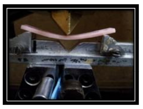
Figure 6: Specimen under stress.

a constant temperature of all thermometers which means that the specimen can no more conduct heat. This process takes about 2 hours for each sample. The losses in heat (e) were calculated from the following equation <sup>(20)</sup>