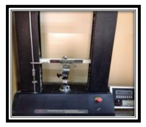
Figure 5: Instron testing machine.