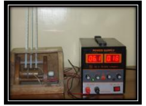
Figure 7: Thermal conductivity testing apparatus.