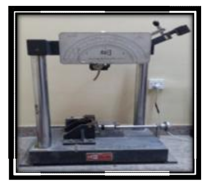
Figure 3: Impact testing devise (charpy type)

Where: F : is the peak load, L : is the span length (50mm), b : is the sample width, d : is the sample