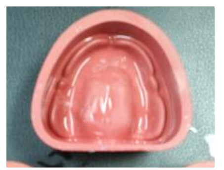
Figure 1: Silicone molds in the initial stages of making the casts.

A universal metallic edentulous cast (standardized metal brass, New York, USA) represents maxillary arch with a uniform residual alveolar ridge free from any discrepancies used to construct master silicon mold (Columbia dent form Corp.). As shown in figure 1.