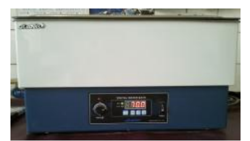
Figure 5: Electronic water bath machine with its control panel.

On the other hand, experimental specimens were processed using an electronic sterilization autoclave (Euronda, type B inspection) according to two selected programs represents long and short curing cycles. So flasks with their clamps were placed inside sterilizing chamber then the door was closed and secured, the two selected programs were operated in order to polymerize the acrylic resins as follows: