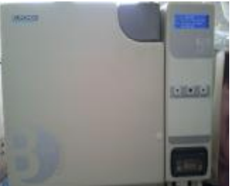
Figure 6: Electronic autoclave machine with control panel.

The chosen cycles were monitored by control panel of the machine in order to control operation stages including: evacuation of air, entrance of steam and starting sterilization with raising temperature and keeping it and finally lowering it for cooling. Water steam was evacuated and curing cycle was finished. The device was shown in figure 6.