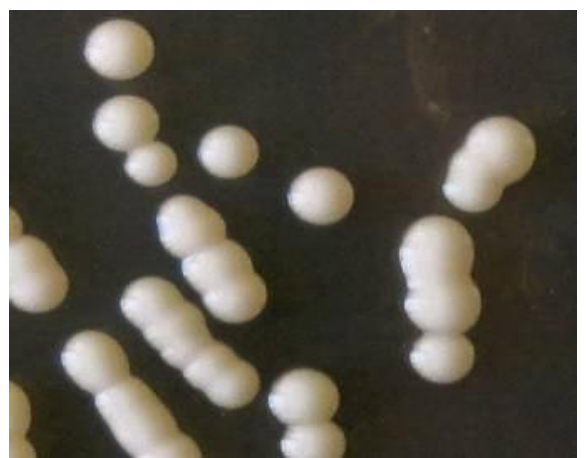
Figure 1: C. albicans colonies on SDA (15x magnification)