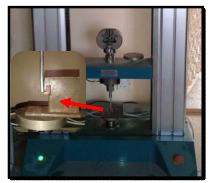
Figure 3: Instron machine with tooth clamp

Specimen attached to metal fixture fixed on the Instron machine immediately to avoid the stress relaxation and subjected to shear stress until failure <sup>(13)</sup>.