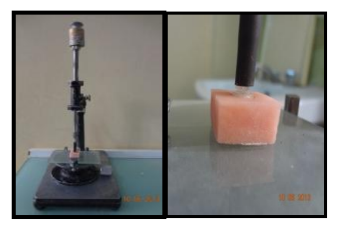
A. Bonding of brackets

One-hundred forty four acrylic blocks were constructed to hold the sample during bonding and debonding procedures. The blocks were made by using a metal mold which consists of two L shape plates and metal plates to form the base on which the L shape plates were fitted. The base plate contains two projections 7.5mm in diameter and 3mm in height which produce a cavity in the acrylic blocks for embedding of composite disks.