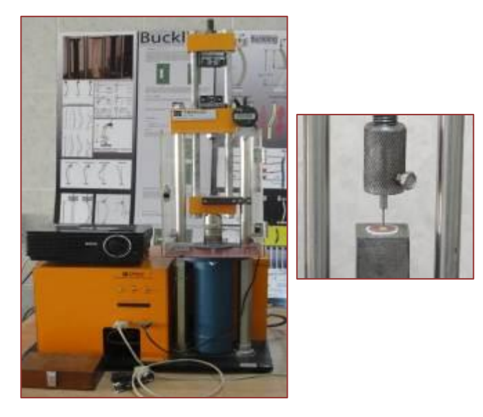
Figure 2: Digital universal testing machine with the tested sample.

Each sample was viewed at 40X magnification digital stereomicroscope to determine the failure mode and put into one of the following categories: (1) adhesive (at the filling material/dentin interface) (2) Cohesive at filling material; and (3) mixed in both adhesive and cohesive modes.