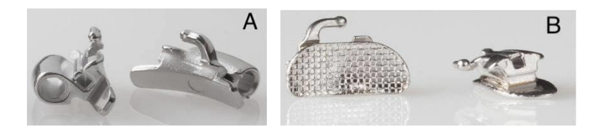
Figure 1: Types of molar tubes based on the mode of attachment. (A) weldable molar tubes (B) bondable molar tubes <sup>(3)</sup>.

A molar tube is a terminal attachment in the shape of a metal tube bonded on the buccal surface of molars through which the archwire slides as the teeth move <sup>(1)</sup>. They can be categorized based on the mode of attachment as weldable (welded onto bands) and bondable (bonded to the tooth surface) (Figure 1), based on the lumen shape as round, oval, and rectangular (Figure 2), based on the number of tubes as single, double, and triple (Figure 3), and based on the technique/prescription as Begg tube, Edgewise tube (0° tip and torque values), and pre-adjusted edgewise (with prescribed in-out, tip, and torque values) <sup>(2)</sup>: