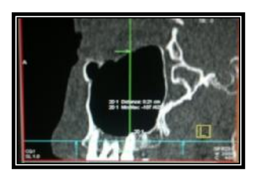
Figure 4. Type 3 (show palatal root of left second molar penetrates or inside the M.S).