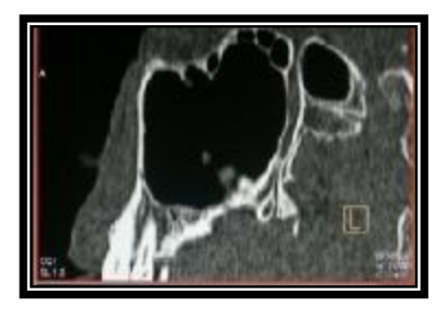
Figure 2. Type1 (buccal root of left first premolar below MS floor)

Means, standard deviations and minimum and maximum values were calculated for all right and left premolars and molars. T-tests were used to compare measurements between left and right sides and between female and male patients.