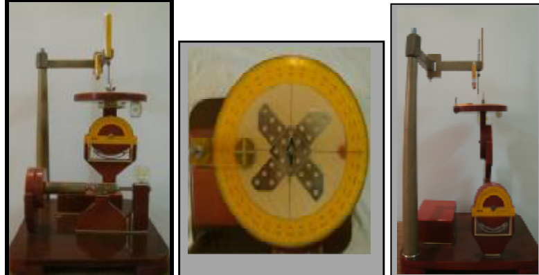
Figure 1: Frontal view, Figure 2: Superior view and Figure 3: Lateral view of Three-Dimensional Goniometer (wooden type).