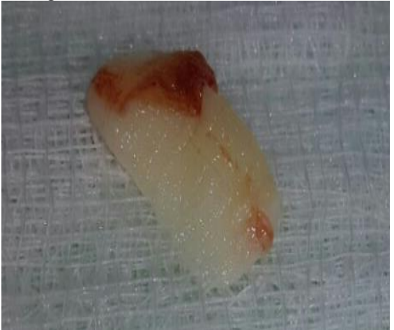
Figure (2): PRF clot after compression.

The fibrin clot that was formed in the middle part of the tube was picked up and the remnants of red blood cells milked off with tweezer. The fibrin clot was placed on clean gauze that have been wetted with normal saline and compressed gently to be ready for installing in the prepared implant site Fig (2).