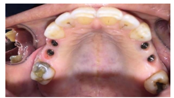
Figure (4): Detaching of healing abutments 12 weeks postoperatively.

Then, measurement of secondary implant stability was done at 8, and 12 weeks after implants placement time, after removal of the gingival former and fix the SmartPeg as in the measurement of the primary stability Fig (4&5).