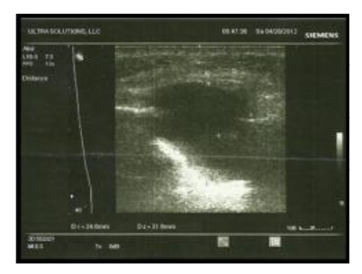
Figure 1: Ultrasound of periapical cyst show hypoechoic texture, well defined margin and reinforced bone