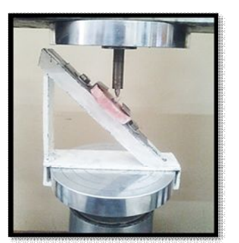
Figure 4: Die analogs mounting Figure 5: Angle of load application Figure 6: Load application in acrylic base