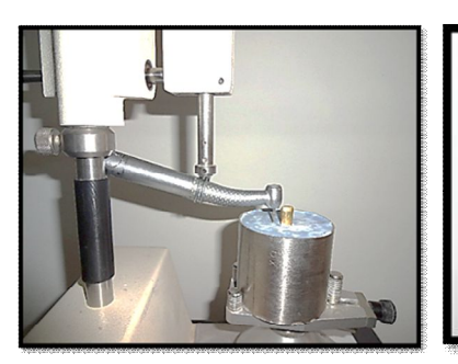
Figure 1: Die preparation.

Ceram bond<sup>®</sup> was applied to metal coping using brush, however, Ceram bond and all steps of ceramic build up must not cover the metal collar figure (2). The Porcelain application using layering technique, according to manufacturer instruction firing chart.