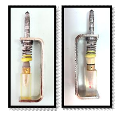
Figure 3: "Spring" loaded holding device

adaptation of each metal coping and finished metal ceramic crown were determined by measuring the vertical marginal discrepancy between the margin of the preparation and the gingival margin of the coping or crown <sup>(7,8)</sup>.