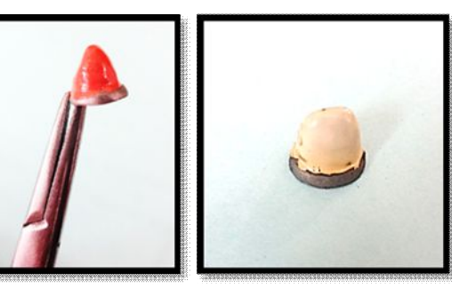
Figure 2: Ceram bond

Specimens were examined under a measuring light traveling microscope calibrated to 0.001 mm (1 µm) at magnification X 100. The marginal