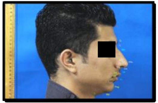
Figure 3: Landmarks used in this investigation. G', glabella; N', nasion; Mn', mid nasal; Prn, pronasal; Cm, columella; Sn, subnasal; Ls, labial superior; Li, labial inferior; Sm, supramental; Pog', pogonion;

Me', menton; C', cervical; Trg, tragus; Stomion superior (Sts),Stomion inferior (Sti).