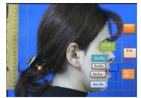
Figure 8: Vertical measurements (parallel to TV line).