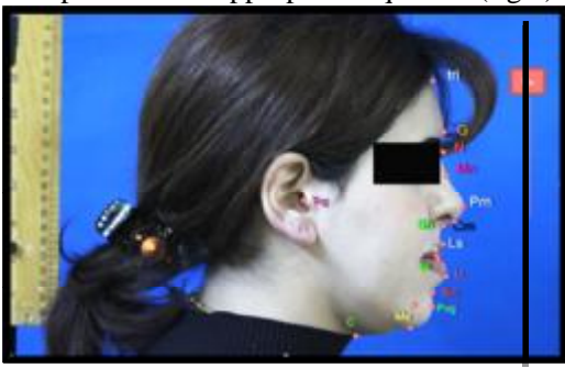
Figure 2: Photogrammetric analyses by AutoCAD program

The pictures after recoding were imported to the AutoCAD program, and appeared in the master sheet, on which the points and planes were determined, and then the linear and angular soft tissue landmarks were marked andphotogrammetric analysis was carried out. The magnification expected in the linear measurements was corrected by using a scale for each picture with appropriate equation (fig 2).