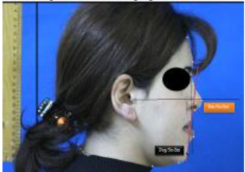
Figure 10: Measurements related to Sn-Sm line.