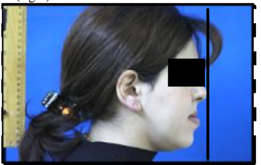
Figure 1: Standardized right side profile in NHP

infront of the subject and on the opposite side of the scale outside the frame there was a vertical mirror, the center of the camera lens was kept at approximately110 cm away from the subject, this distance was standardized to obtain sharp image <sup>[15]</sup>. In order to take the records for right side of subject in NHP, the subjects were asked to walk a few steps, stand at rest facing the mirror, in front of the scale and look into their eyes in the mirror, and place their arms at their side. The lips should also be relaxed, adopting the position as they normally show during the day, before starting the recording procedure, the patients were instructed to remove the eye glasses and the operator ensured that the patient's forehead, neck, and ears were clearly visible during the recording <sup>[14]</sup>(fig.1).