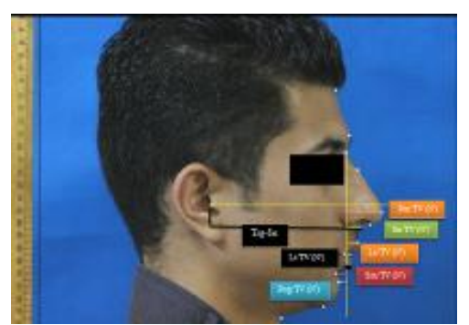
Figure 9: Horizontal measurements (parallel to TH line).