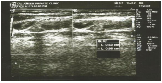
Figure 5:Grey scale ultrasonography of rightposterior TLA after 45 days of anti TB treatment show decreasing in the size of the lymph nodes and preserving fatty hilum.(1st reading S=12.7mm& 2^{nd} reading S=5.6mm)

Evaluation of early therapeutic responseby Ultrasonography was started46 days after the 1st dose of treatment. In this visit grey scale ultrasonography was taken and the previous parameters were recorded and compared with the previous visit readings so the treatment can be evaluated