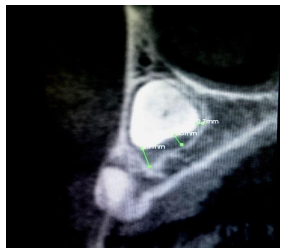
Figure 5: Alveolar width measurement.

5. Alveolar width (in millimeters): mean widtharound the tooth(fig.5),in sagittal view.<sup>(19)</sup>