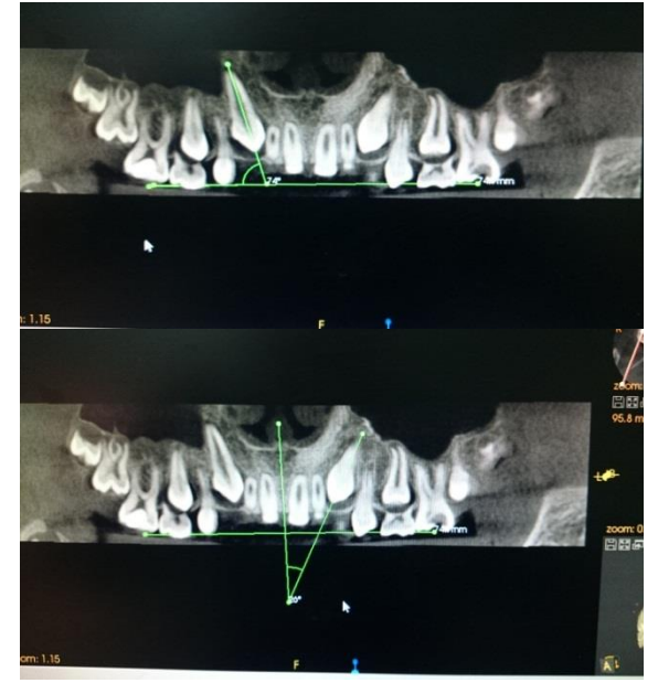
Figure 3: Vertical and horizontal angulation measurement, coronal view.