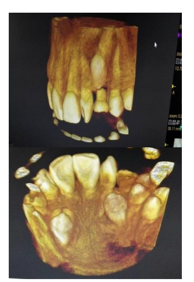
Figure 1:Impacted maxillary canine localization.

3.Cusp tip distance : The distance from the tip of cusp to occlusal plane line, in coronal view(fig.4)