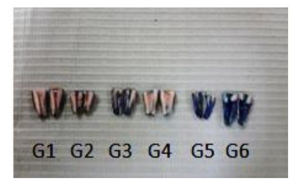
Figure 1: The dye penetration in split roots