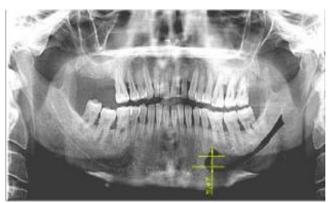
Figure 4: The vertical extension of anterior loop of mental nerve

Table 1: The frequency distribution and percentage of the total cases with anterior loop of mental nerve and its vertical and horizontal dimensions.