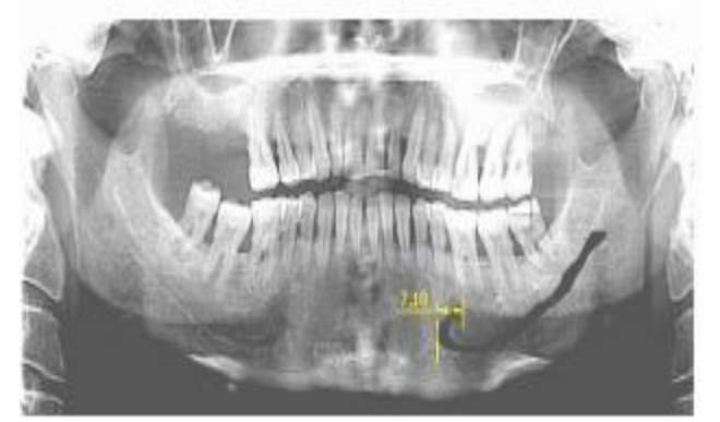
Figure 3: The horizontal extension of anterior loop of mental nerve

More accurate of anterior loop assessments were obtained by Uchida et al. <sup>(21)</sup> who used cone beam computed tomography in 4 cadavers and dissected 71 cadavers. The anatomic measurements revealed mean anterior loop size of 1.9 \pm 1.7 mm and range 0.0 to 9.0 mm.