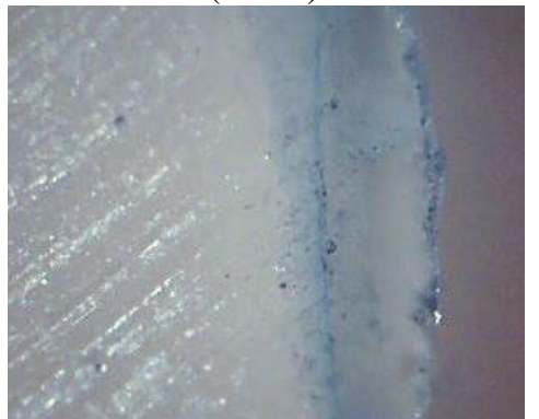
Figure 4: Photograph view of ground section shows dye penetration into middle third of the interface (score 2)