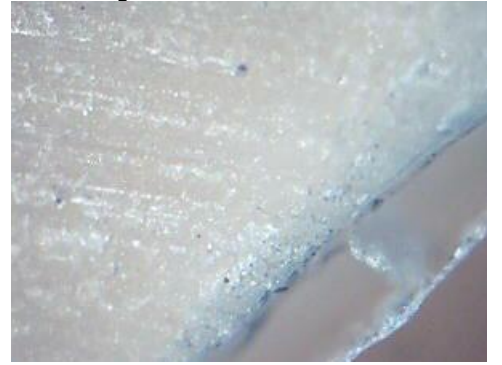
Figure 3: Photograph view of ground section shows occlusal one third of dye penetration (score1)