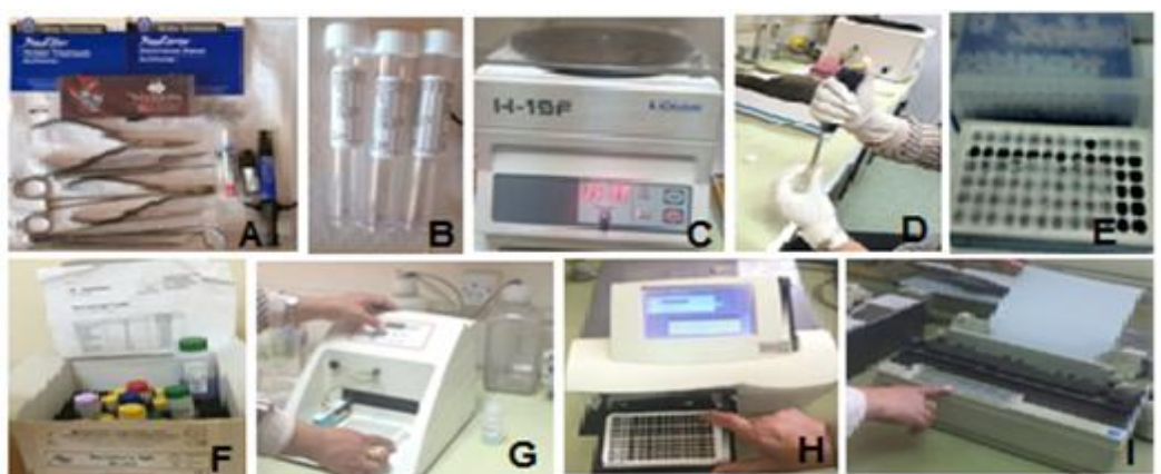
Figure 1: Equipment and materials used in this study: A. Orthodontic instruments and materials B. Test tubes C. Centrifuge machine D. Adjustable pipette E. Eppendrof tubes in rack F. Secretory IgA ELISA kit G. Micro plate ELISA washer H. Micro plate ELISA reader I. Printer of ELISA reader

The current study is a unique study for determination the sIgA level ( \mu g/ml) at these time intervals T0, T1, T2, and T3 during fixed orthodontic treatment.