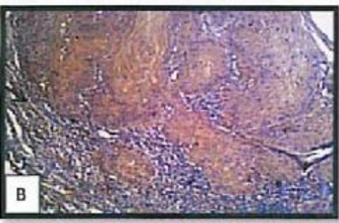
Figure 3: D2-40 immunoexpression in A. SCC B. VSCC