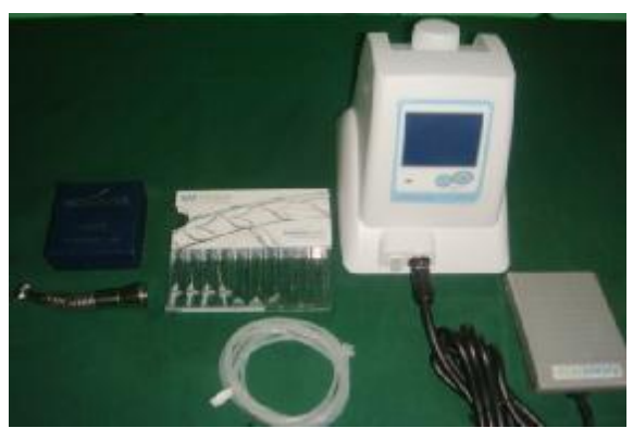
Figure 1: Self- Adjusting File (SAF) system components.

The data were collected and analyzed using SPSS (Version 18) for statistical analysis. One-Way Analysis of Variance (ANOVA) test and Least Significant Difference (LSD) test were used to determine whether there is a statistical difference among the groups and within group at different thirds with a significance level of P \leq 0.05 .